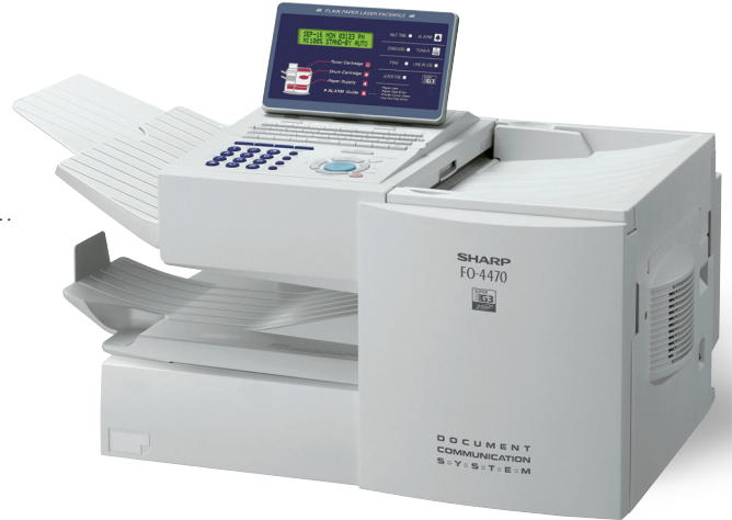
FO-4470 Document Communication System

Designed to streamline your workflow, the new Sharp FO-4470 Super G3 Workgroup Facsimile delivers all the features your busy workgroup demands... and so much more. With a powerful 16-ppm print engine and Super G3 modem technology , the FO-4470 scans at a speedy 1.3-seconds—so there's no wasted time. For added efficiency, the FO-4470 comes standard with advanced features including document memory backup , broadcasting to 154 locations , personal auto-dial phone books , and Remote Diagnostics . With all these powerful features, proven performance, and Sharp's world-famous reliability, the FO-4470 Super G3 Workgroup Facsimile delivers the functionality your business needs today, as well as the versatility to expand as your business evolves.