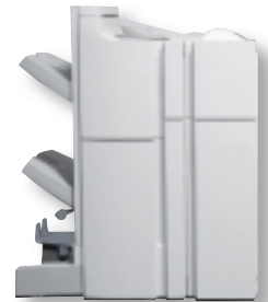
A choice of optional finishers enables users to easily produce a variety of documents internally—reducing the need to outsource.