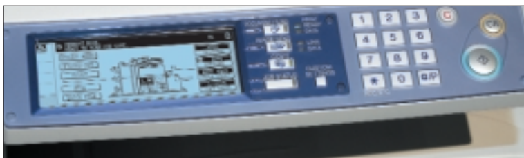
The user-friendly graphical interface on the control panel makes it easy to select and program various features.