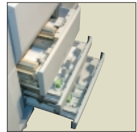
Large 3,100-sheet standard paper capacity