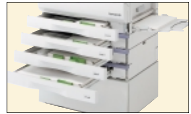
Add the optional paper trays for a total online paper capacity of 1,100 sheets.

Add fax functionality to your workflow with the Super G3 Fax Module. With duplex scanning, ledger-size reception, and convenient web-based management the AR-M207 IMAGER delivers the added efficiency busy offices require. And with broadcasting up to 200 destinations and 350 auto-dial numbers, the AR-M207 IMAGER can easily handle high-volume environments.