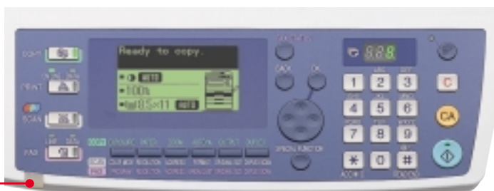
The user-friendly control panel makes the AR-M207 IMAGER simple to operate.

Fax Reception Light flashes to alert you when a new fax has arrived