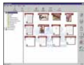
Complete document management on your PC with Sharpdesk