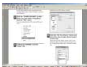
Printer Driver Screen