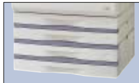
Add the optional 250-sheet x 2 adjustable paper trays for a total online paper capacity of 1100 sheets.